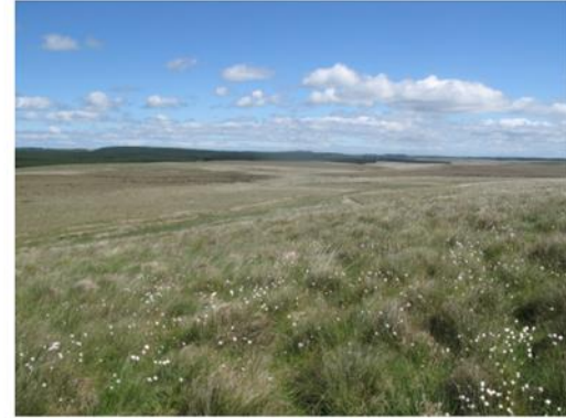
Butterburn Flow.