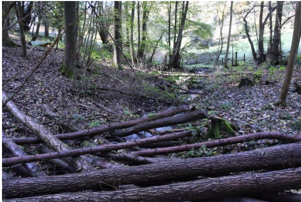
B - Minor works (small capital or revenue work)