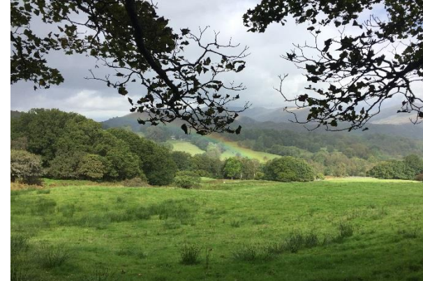
D - Whole scale land use change