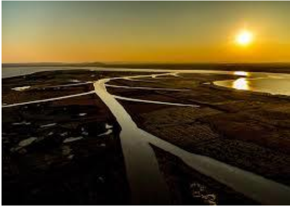
A - Heavy works (large capital projects)