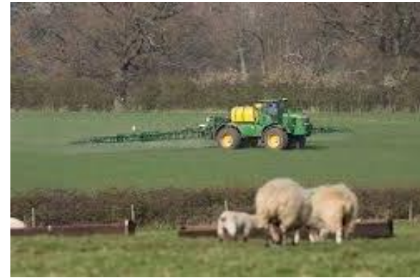
C - Farming and land management practice